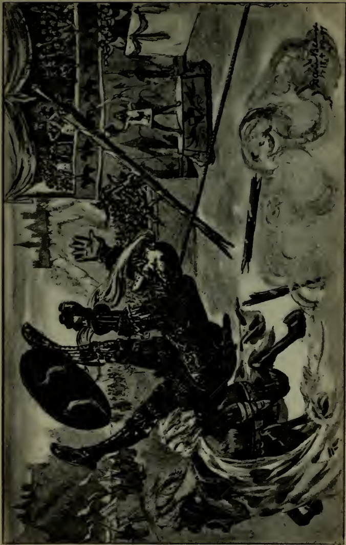
Great Scott, But There Was A Sensation!